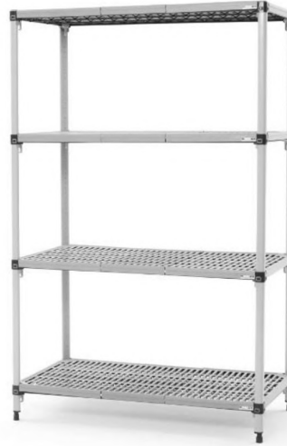
Storage Shelf for Pot Pan