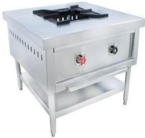
Stock Pot Stove