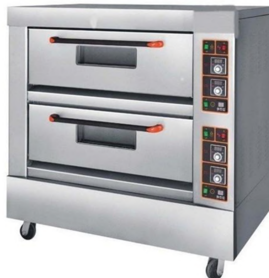
Double Deck Oven