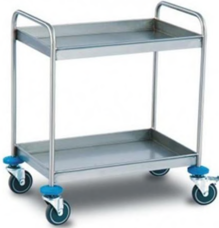
Dish Collecting Trolley