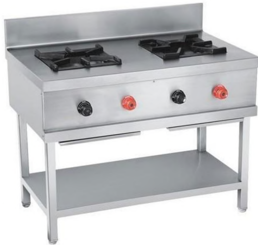
Two Burner Indian Range