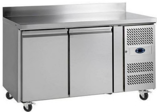
Under Counter Refrigerator