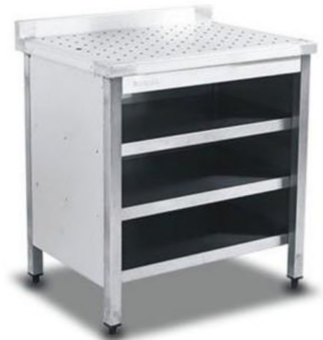
Bar Table with Drain Shelves