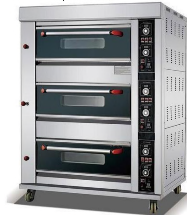
Triple Deck Oven