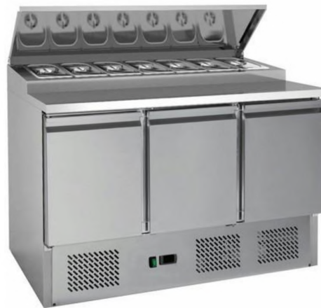
Pizza Makeline Unit