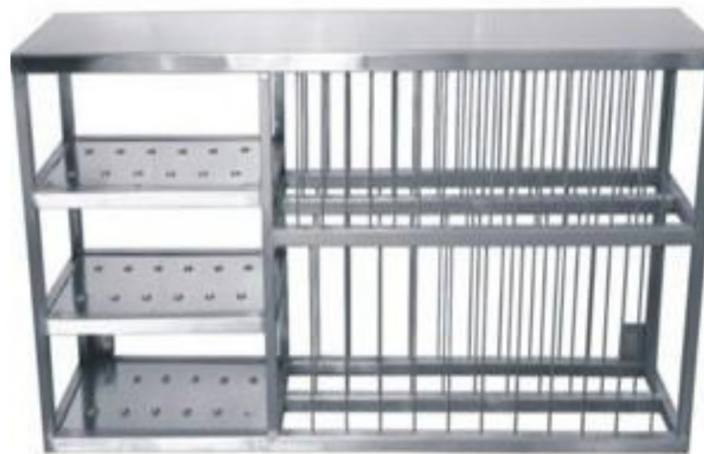
Plate / Glass Rack