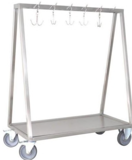
Meat Hanging Trolley