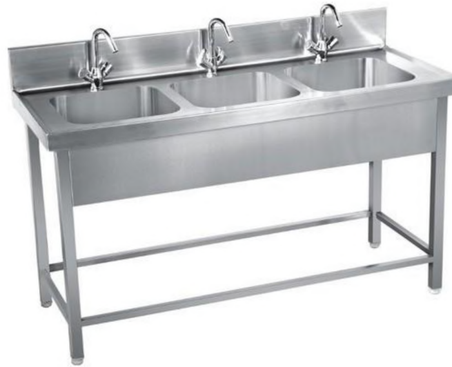
Three Sink Unit