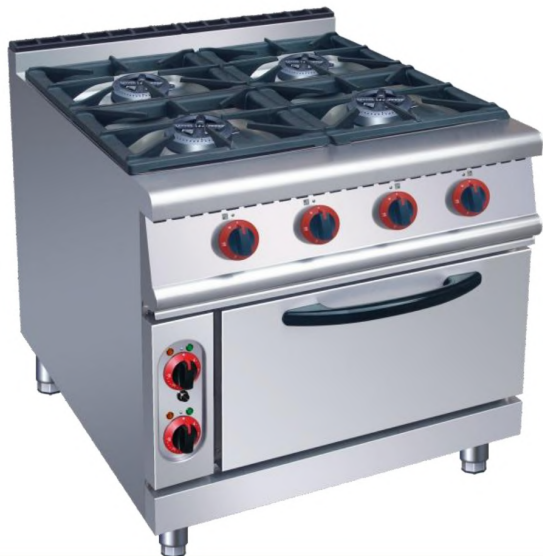
Four Burner with Pizza Oven