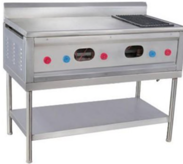
Chapati Plate cum Puffer