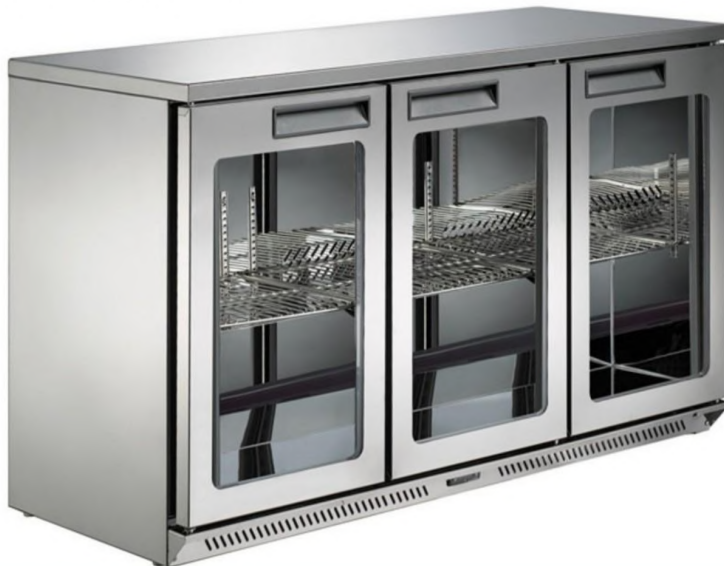
Under Counter Refrigerator (Display)