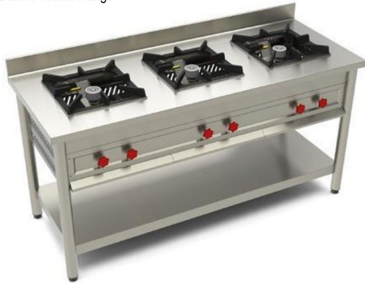
Three Burner Indian Range