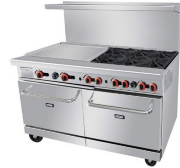
Burner with Griddle