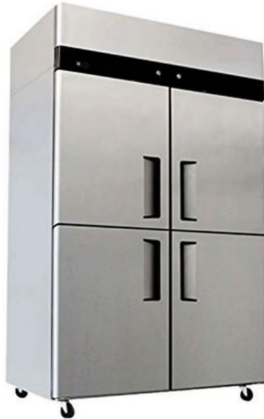
Upright Refrigerator (Four Door)