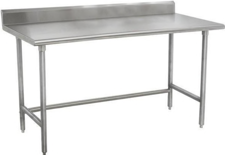
Work Table with Cross Bracing