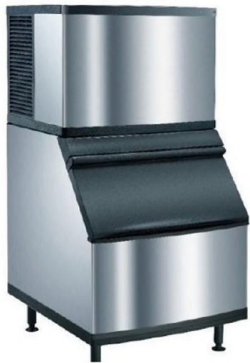
Ice Cube Machine