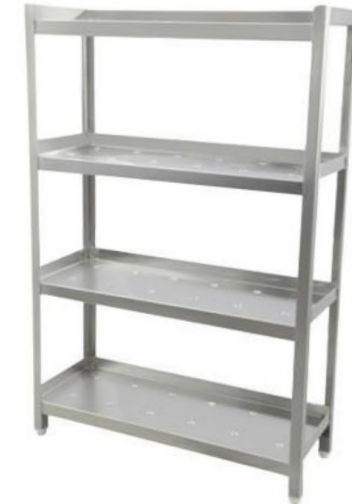
Clean Dish Rack