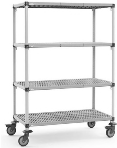
Mobile Storage Shelf