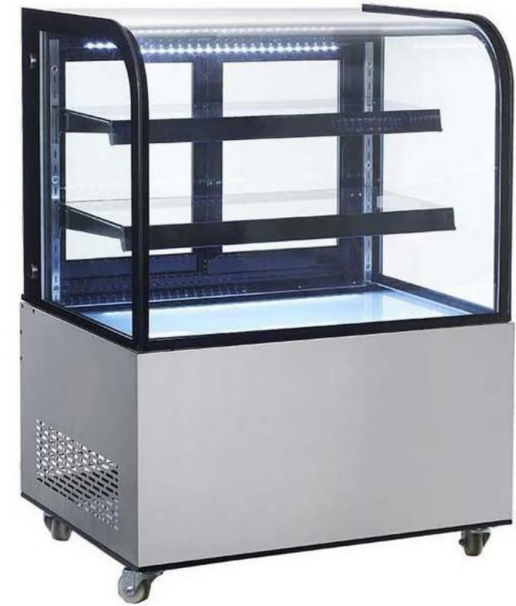
Pastry Display Refrigerator