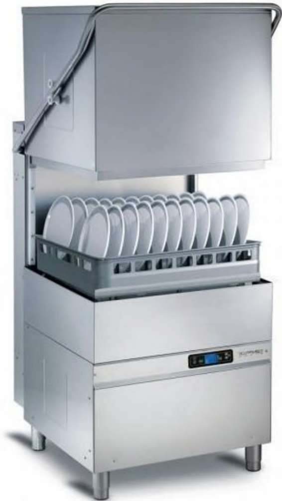
Hood Type Dishwasher