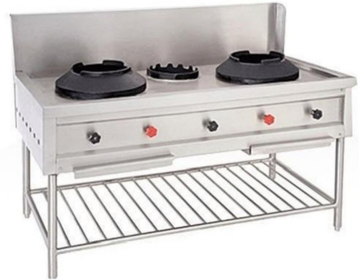
Chinese Burner Range