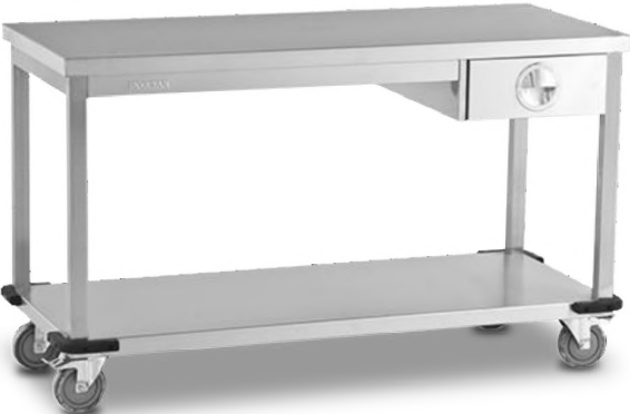
Work Table with Single Drawer / Single U/s