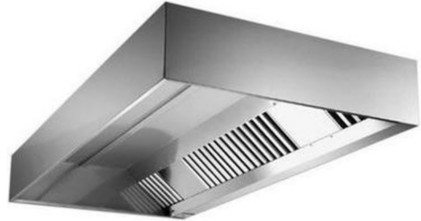
Hood / Island Type / With Flame Guard Filter