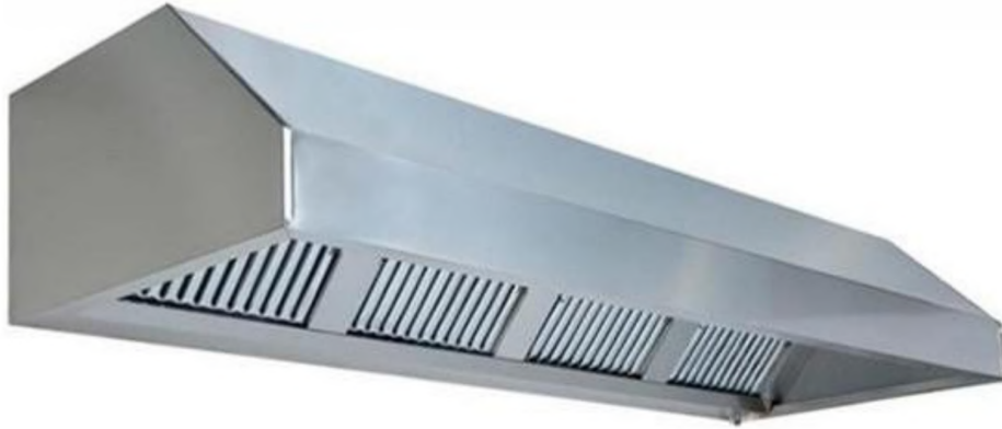
Hood / Wall Type / With Flame Guard Filter