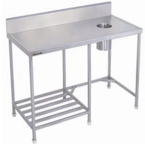
Soiled Dish Landing Table